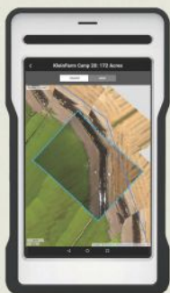
Second View: Clicking a spot pulls up georeferenced High-Resolution Images