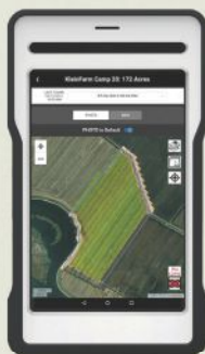
First View: Quick Look