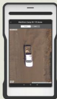
Third View: Pinch and Zoom Navigation to see every detail

Recon's Quick-Look software provides three levels of immediately downloadable data.